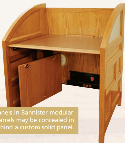
Power channels in Bannister modular computer carrels may be concealed in the base behind a custom solid panel.