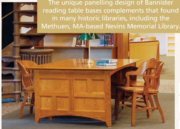
The unique panelling design of Bannister reading table bases complements that found in many historic libraries, including the Methuen, MA-based Nevins Memorial Library.