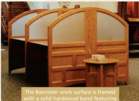
The Bannister work surface is framed with a solid hardwood band featuring an elegant eased knife-edge.