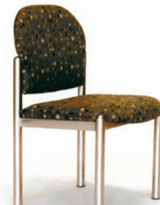
Its tubular steel frame makes the Empire chair an ideal counterpart to the Bridge design range.