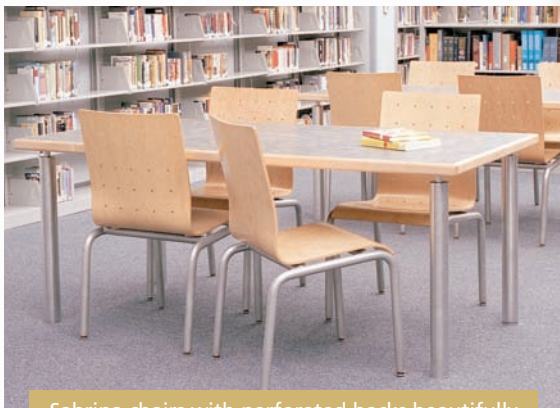
Sabrina chairs with perforated backs beautifully offset the tubular steel legs and marbled laminate work surface of Bridge reading tables at the Charles A. Wagner Branch Library in Metairie, LA.