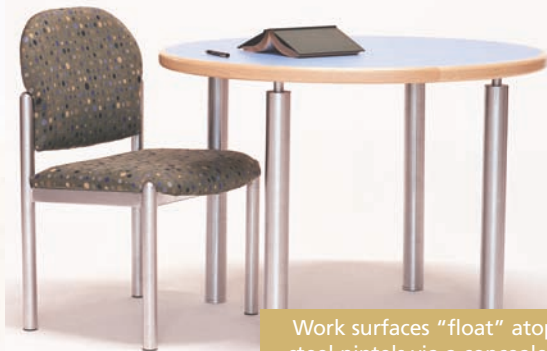
Work surfaces "float" atop steel pintels via a concealed steel plate assembly