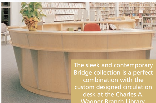
The sleek and contemporary Bridge collection is a perfect combination with the custom designed circulation desk at the Charles A. Wagner Branch Library.