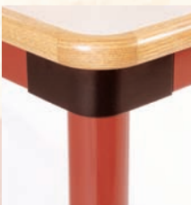
A 2" metal surround embraces a steel plate and machine bolt assembly of legs, tabletop and apron rail.

Legs and apron rails are crafted of 16-gauge steel, which is powder-epoxy coated for durability in a choice of colors. Tubular legs are 2 1/2" in diameter and attach to index, reading, PAC and table carrel tabletops using a radiused steel plate and threaded machine bolt assembly. The outside corner of