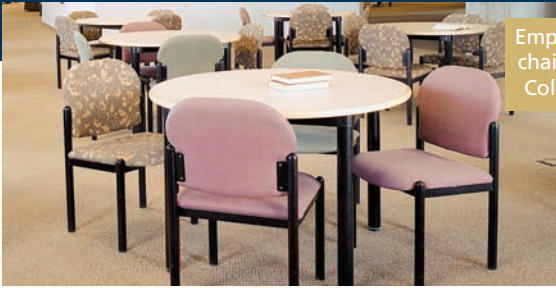
Empire reading tables and upholstered side chairs add vibrant color to San Diego Mesa College's $20M Learning Resource Center.