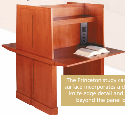
The Princeton study carrel work surface incorporates a chamfered knife edge detail and extends beyond the panel bases.