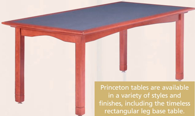
Princeton tables are available in a variety of styles and finishes, including the timeless rectangular leg base table.