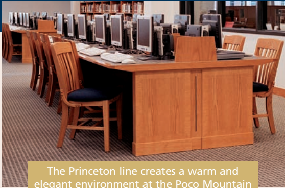
The Princeton line creates a warm and elegant environment at the Poco Mountain High Library in Pennsylvania.