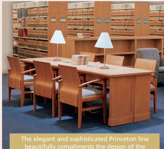
The elegant and sophisticated Princeton line beautifully compliments the design of the Howard University Law Library in Washington DC.